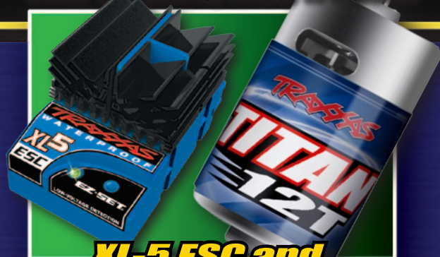
XL-5 ESC and Titan 12T 550 Motor