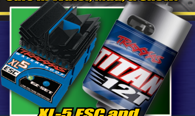
XL-5 ESC and Titan 12T 550 Motor