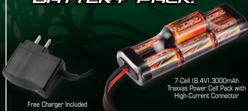
7-Cell (8.4V) 3000mAh Traxxas Power Cell Pack with High-Current Connector