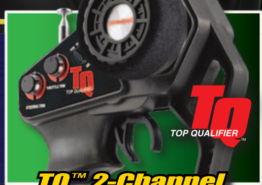
TQ™ 2-Channel Radio System