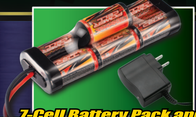
7-Cell Battery Pack and Free Charger Included