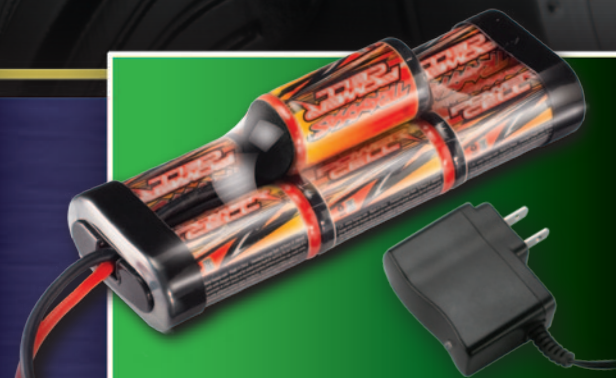
7-Cell Battery Pack and Free Charger Included