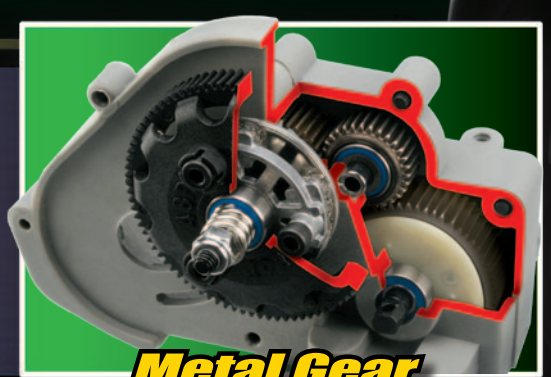
Metal Gear Transmission