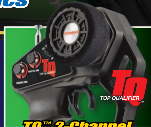
TQ™ 2-Channel Radio System