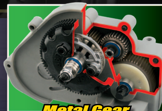
Metal Gear Transmission